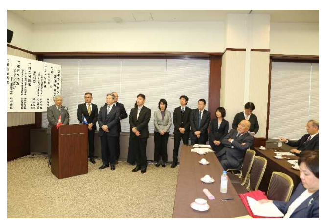
Introduction of new Board members

Then, the selection of the new President, the new Vice Presidents and the other Board members were approved.